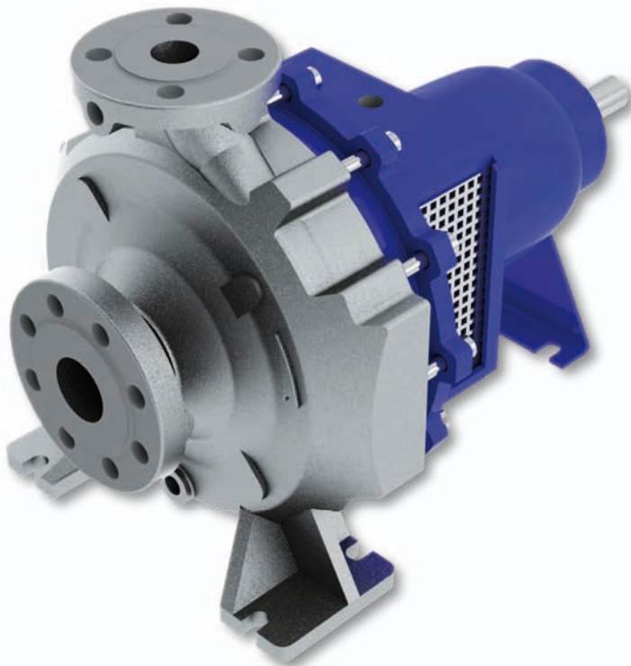
Pictured: Isoglide Super Duplex render view